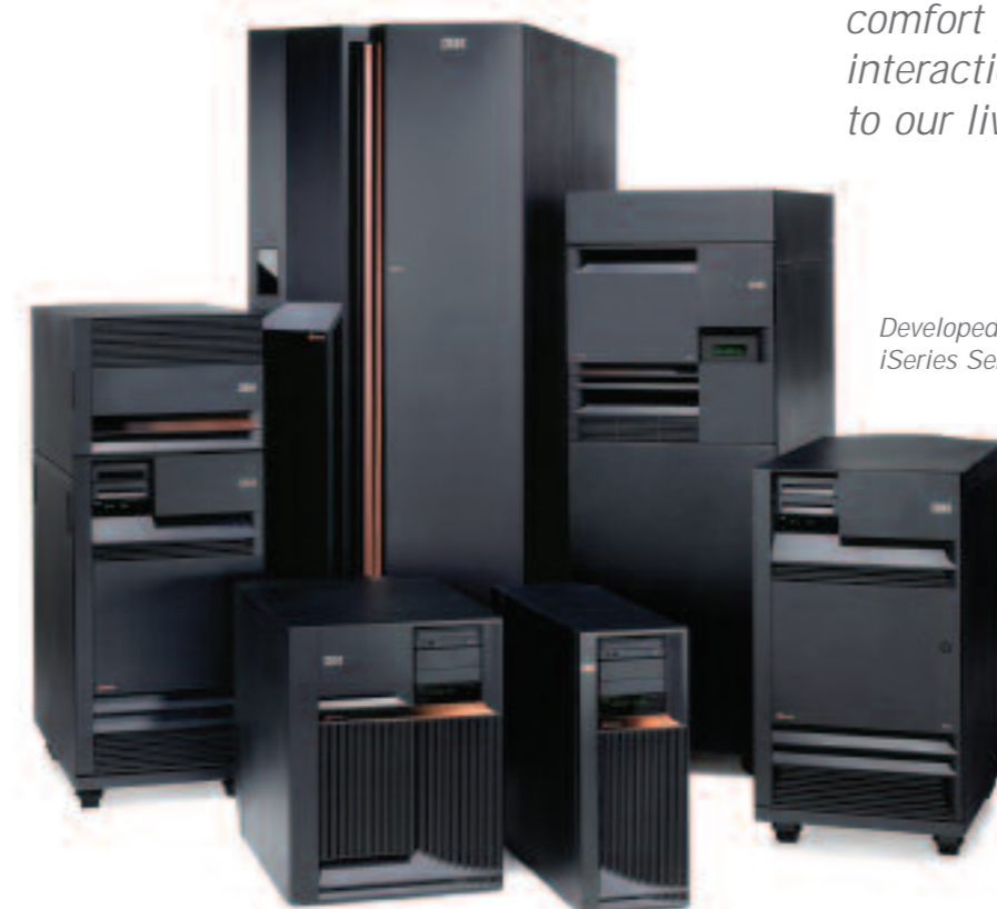
Developed on IBM iSeries Servers